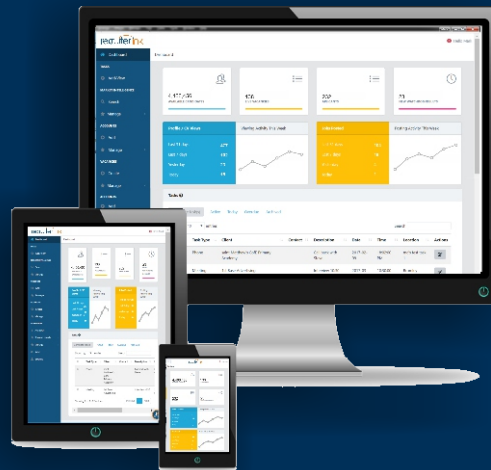
The Recruiterlink Platform

The Recruiterlink BD Partnership offers self motivated sales professionals a great opportunity to generate a significant and sustainable income stream on either a part time or full time basis.